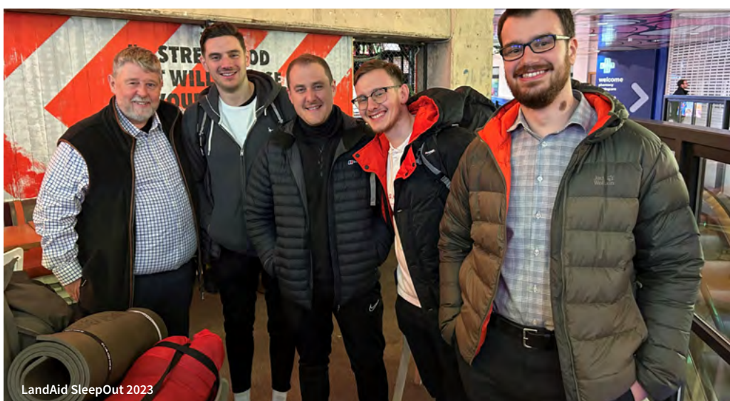
LandAid SleepOut 2023